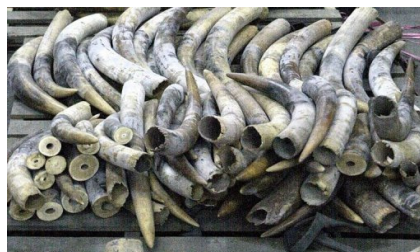
Confiscated elephant tusks

3 of those arrested were Cameroonian, the majority were from much further afield - Senegal.