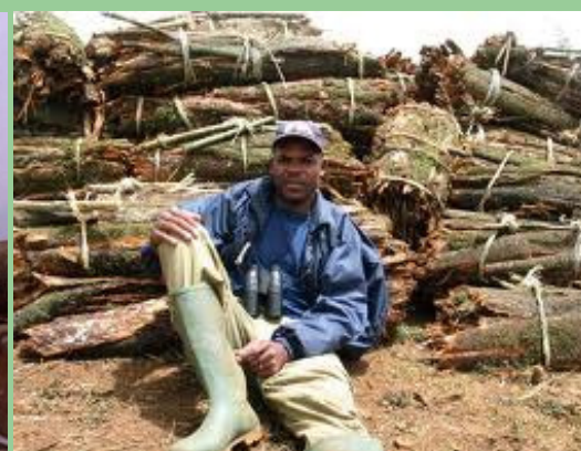
Above: African cherry tree ( Prunus africana ) bark harvested in Mount Oku, Cameroon