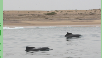
Atlantic humpback dolphins, Dauphin à bosse de l'Atlantique ( Sousa teuszii )

The Atlantic humpback dolphin ( Sousa teuszii ) has been highlighted as a research priority by the IUCN Cetacean Specialist Group due to its low abundance, restricted range and potential vulnerability to anthropogenic impacts. Data are therefore urgently required on the population size and structure, distribution and status of these dolphins in all of their known range states, in order to assess and implement appropriate conservation and management plans. WDCS led a study off Flamingos in Namibe Province, Angola, successfully identifying an area of Atlantic humpback dolphin occurrence with some key findings including a total of 48 humpback dolphin sightings and the identification of key habitat types used by humpback dolphins.