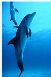
Atlantic humpbacked dolphin ( Sousa teuszii ) listed in CITES Appendix I

◆ Useful resources: IUCN Orchid Specialist Group < http://www.orchidconservation.org/osg/ >; Victor and Dold, Threatened plants of the Albany Centre of Floristic Endemism, South Africa , South African Journal of Science 99, September/October 2003 < http://eprints.ru.ac.za/345/1/sajs_dold_threatned_plants_of_the_albany.pdf >; factsheet on Eulophia speciosa < http://www.plantzafrica.com/plantefg/eulophspec.htm >