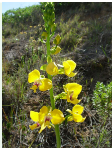
Eulophia speciosa included in CITES Appendix II @ Royal museum for Central Africa

◆ Name: Orchid; orchidée (no common name) ( Eulophia speciosa )